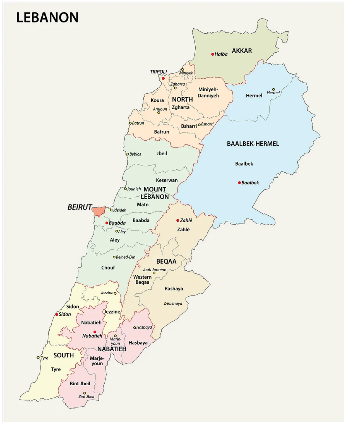
Fig 2. Map illustrating Governorates of Lebanon

Mediterranean Sea. It is the nation's largest city and most important commercial hub. 2