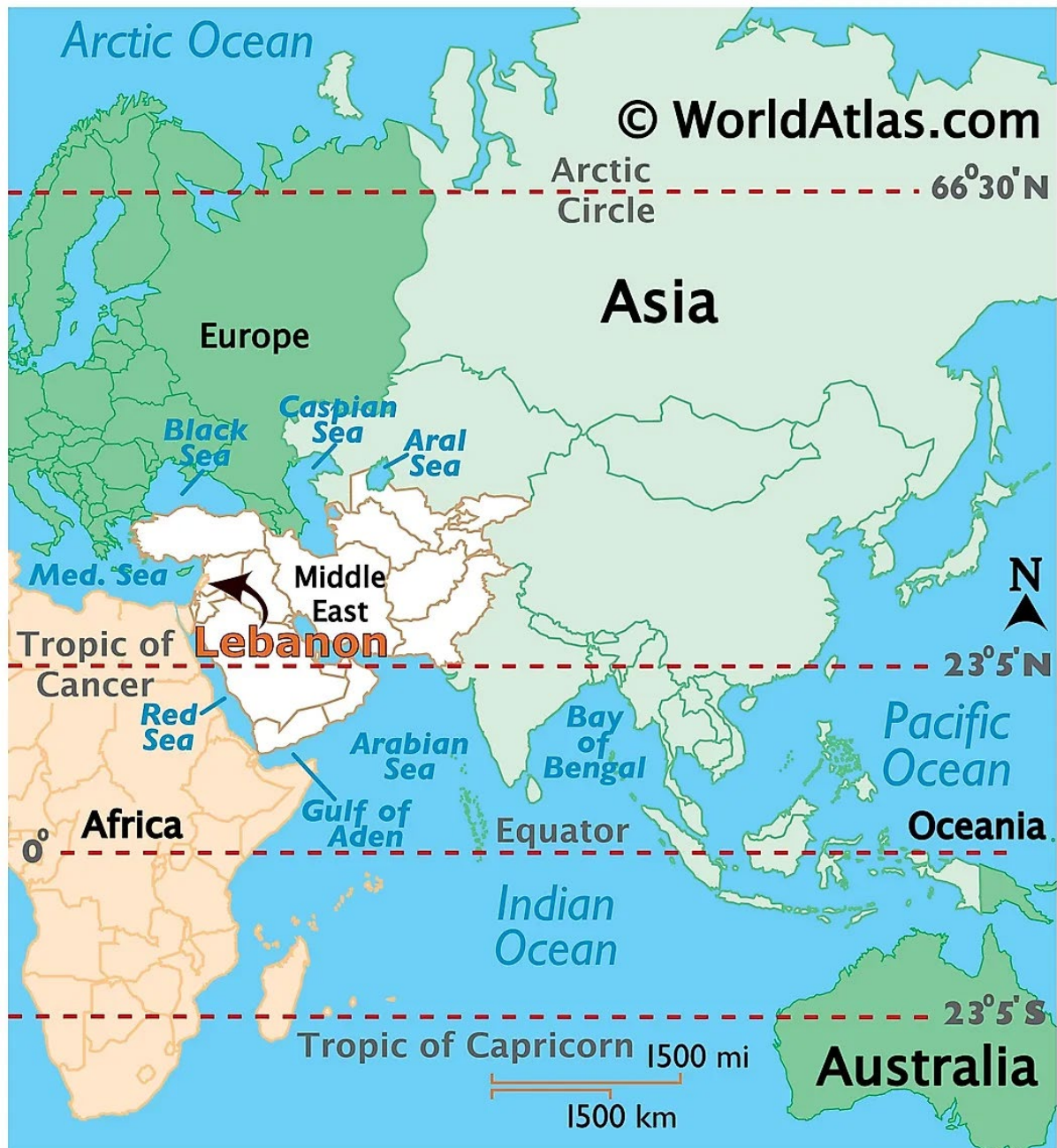
Fig 3. Map showing where Lebanon is. (Borrowed from worldatlas.com)