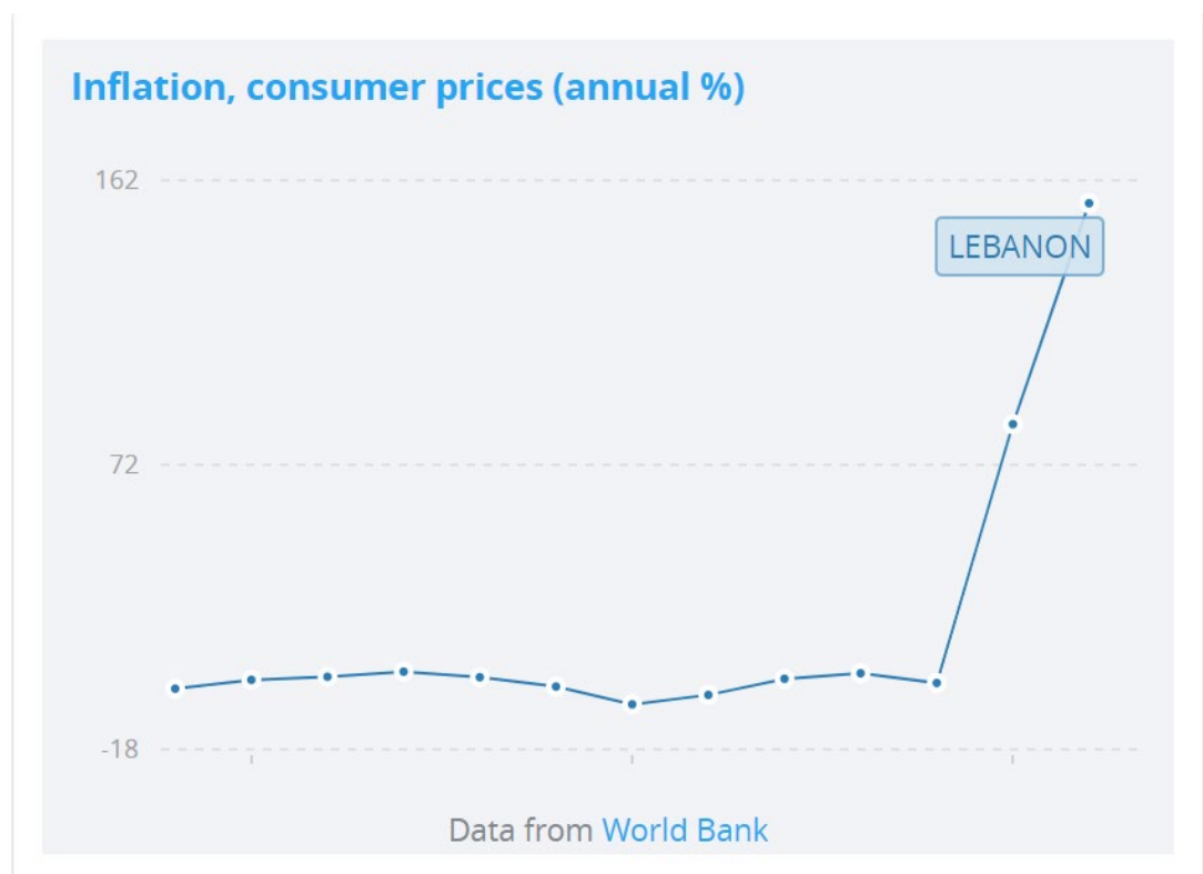
Figure 3. Inflation spike between 2018 and 2020

The Lebanese currency is the Lira (Lebanese Pound), which has lost significant value secondary to massive inflation in the triple digits. As illustrated in the World Bank graph below (Fig 3), Lebanon’s inflation spiked dramatically in 2018 without signs of slowing and became one of the highest in the world, with inflation rates in 2021 hitting 154%. For comparison, inflation in 2021 was 1.0% in China, 4.7% in the United States, 5.1% in India, and 23.6 in Liberia. 8