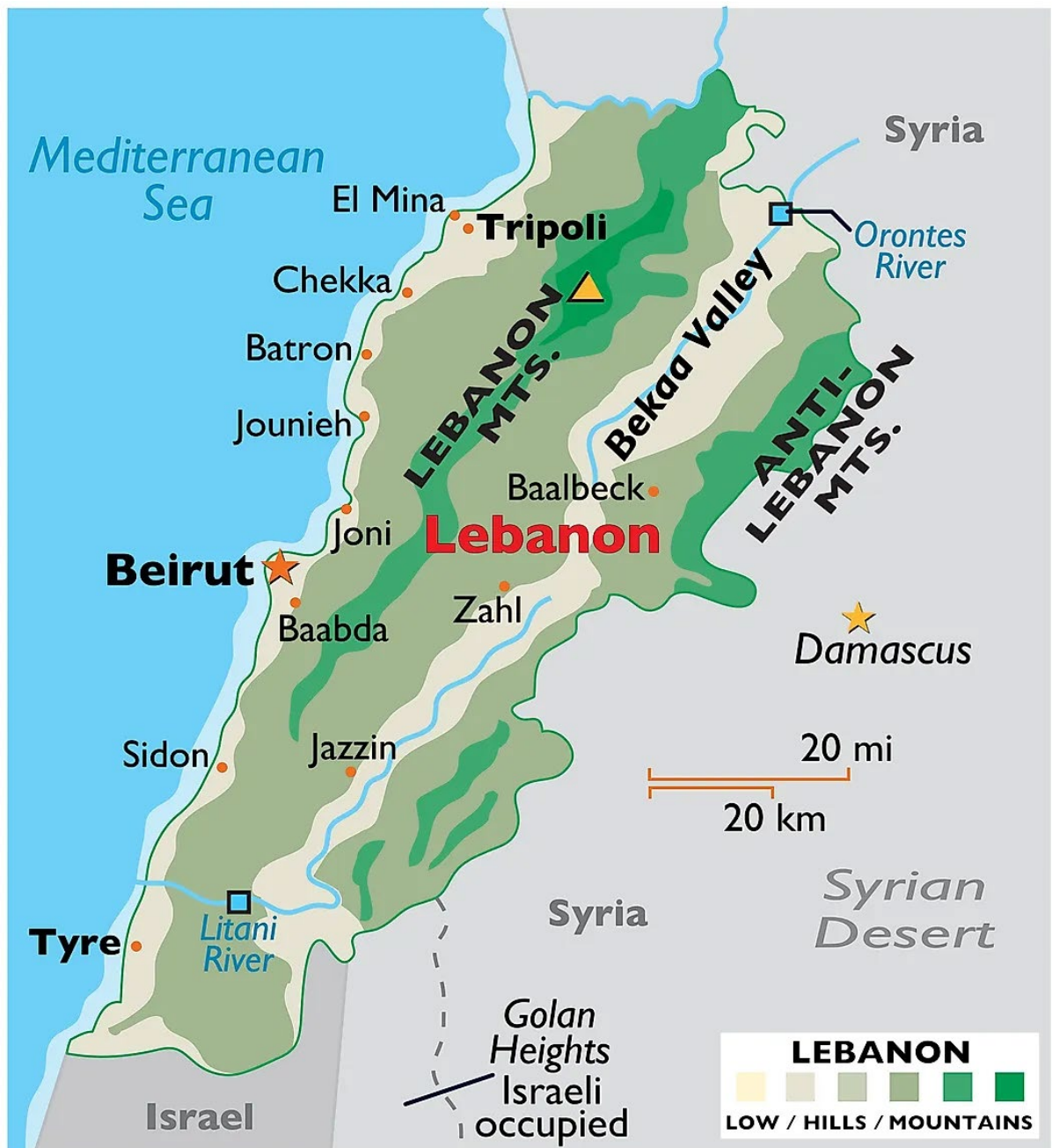
Fig. 1